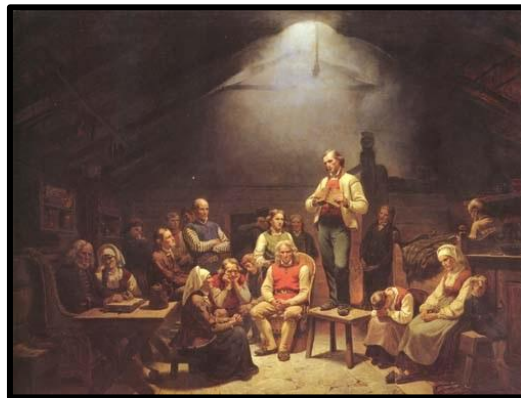
Figure 2 Adolph Tidemand, A Nineteenth-century Lay Preacher , 1852. Public Domain.

A lay preacher is an evangelist or religious teacher who has not fulfilled all of the requirements to become a formally ordained cleric (van Lieburg: 2003) (fig. 2).