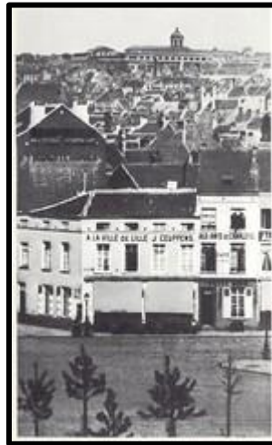
Figure 9 Vincent’s Brussel’s studio (1880-1881) was located in the building in the central foreground.