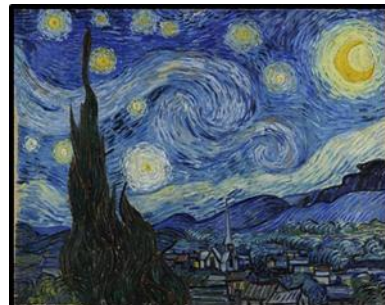
Figure 11 The Starry Night , 1889. Public Domain.