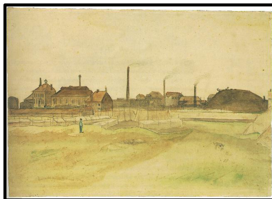
Figure 5 Coalmine in the Borinage , watercolor, 1879. Public Domain.

Vincent did not produce much artwork during this period, but he did paint a small watercolor showing one of the Borinage's largest coalmines (probably the Charbonnage de Marcasse, fig. 7). In the center of the image, Vincent placed a small, solitary figure dressed in blue. The man standing in the midst of the bleak environment may symbolize Vincent's loneliness and growing sense of isolation (fig. 5). Vincent van Gogh is known for reflecting emotions and ideas in his art, rather than simply representing the natural world. Vincent's other works of this period were illustrations. In his free time, he drew large thematic maps of Palestine, which Vincent thought could be of use to schools and confirmation classes – and which he hoped he could sell to help support himself (Jansen 2009: FR b2448). Unfortunately, none of these maps has survived.