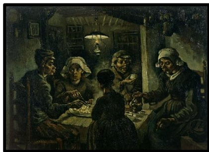
Figure 10 The Potato Eaters , 1885. Public Domain.

The rest of Vincent van Gogh’s life can be viewed as a new mission, in which he used his art to bring comfort to humanity and to convey cosmic, spiritual forces. The most famous painting of his first phase (1880-1886) was The Potato Eaters , of 1885, a social realist image filled with moralistic flavor (fig. 10). Vincent wrote that the family he depicted “have tilled the earth themselves with these hands they are putting in the dish ... they have thus honestly earned their food” (Jansen 2009: 494 Br. 1990: 497 | CL: 401). One art historian posited The Potato Eaters embodied the mysteries of the Christian Eucharist sacrament (Raskin 1990). Even the masterpiece of Vincent’s mature Post-Impressionist phase (1886-1890), The Starry Night , of 1890, contains religious meaning (fig. 11). Its swirling, nighttime sky is a dynamic, living space, a heavenly space. Art historian Lauren Soth described Starry Night , which was painted just months before the artist’s untimely death, as a disguised “religious subject,” which expressed “[Vincent’s] deepest religious feelings” about humanity’s relationship to God (Soth 1986: 308, 312). These and many other paintings show that, although Vincent made his mark as an artist, he never lost his sense of life as a spiritual quest or his memories of the years he spent as an evangelist and missionary.