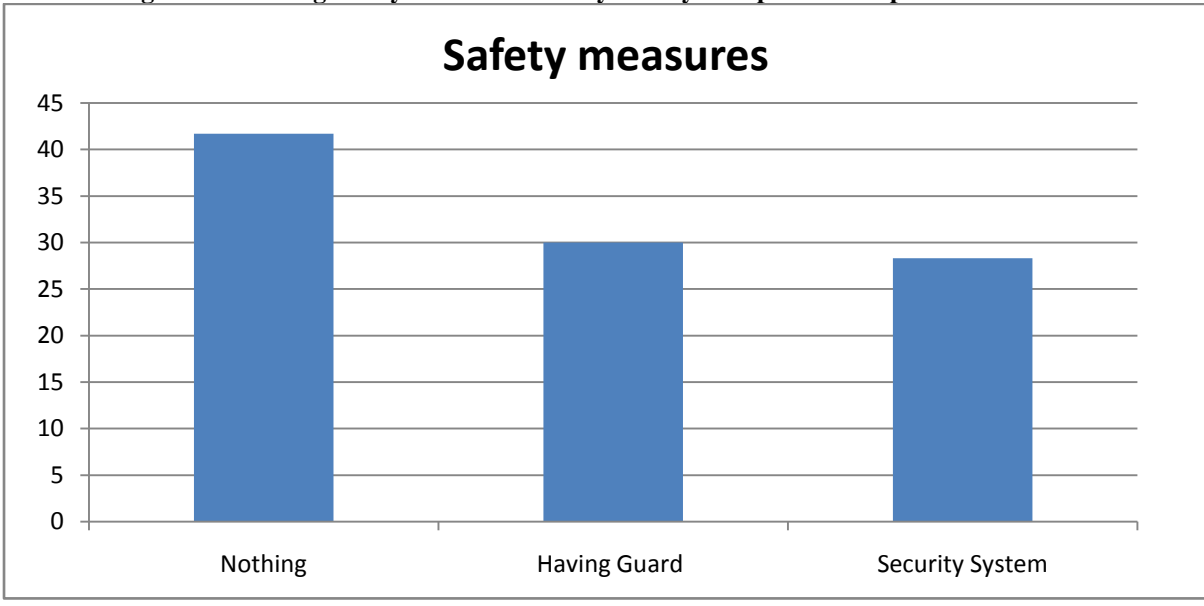
Figure 2: Showing Safety measures used by elderly to cope with the problem of crime

• Secondary data from the various newspapers highlights that most of the crimes against elderly were related with Robbery followed by property and murder. For the loot and robbery many elderly persons who live alone are brutally left in the pool of blood, smothered to death by pillow. It was also found that especially elderly women living alone were targeted from crime.