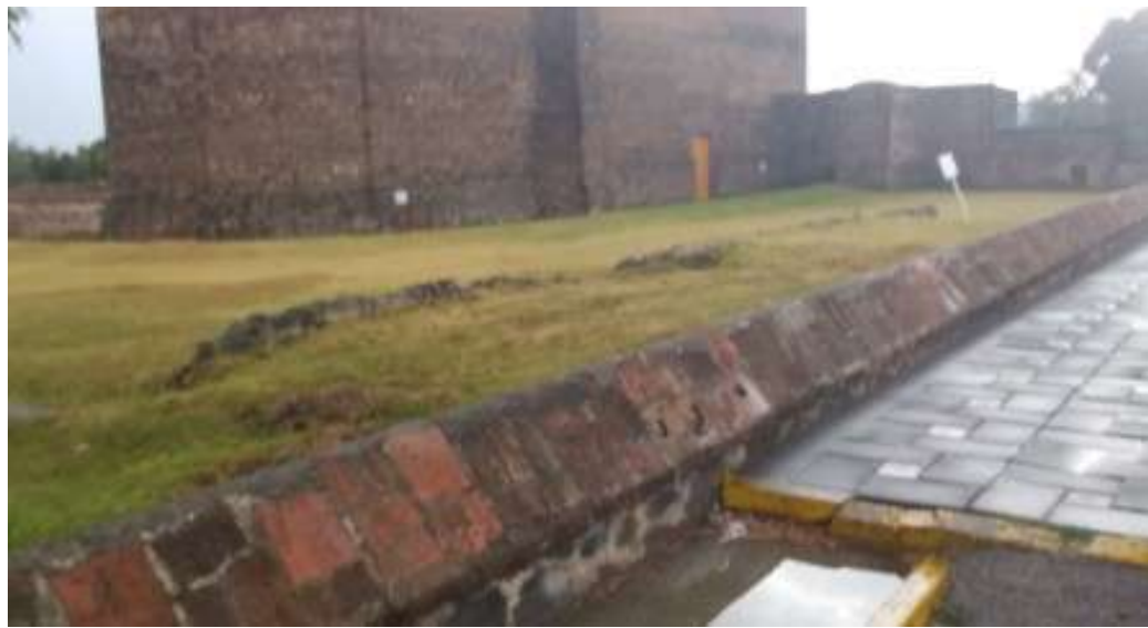
Figure 10. Side facade and remains of the pyramid in the green area

It is worth mentioning that, in the INAH historical archive, a photographic report dated June 4, 1990 is observed, where elements that no longer exist, such as some walls of the cloister, can be observed.