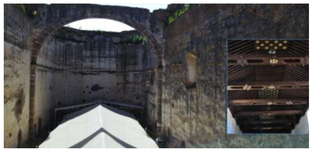
Figure 8. Possible roofing (personal file).

The stucco was made with stone lime, baba nopal, turkey egg, lime and tezontle, its hardness is similar to the current When Europe ends the Middle Ages revival arises, and the Catholic Church adopts three types of architecture as a triumph against the Protestant, the Churrigueresque present in the Church of Ocotlán, the baroque that is simpler and the plateresque that is even simpler.