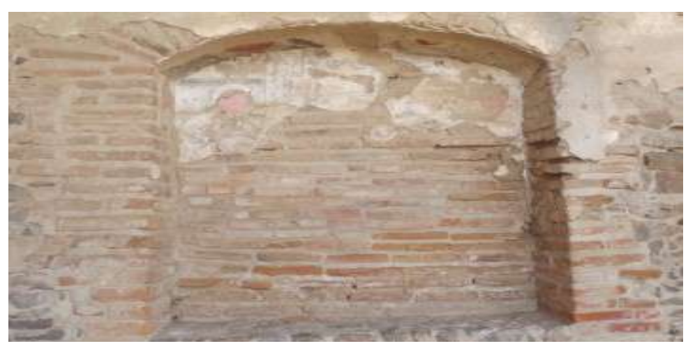
Figure 6 Painting in right side niche (Personal File)

One of the lies of the story is the original tribes of America did not know how to make a partition and this is proven in the state of Tabasco in the Community of Comalcalco<sup>5</sup>, there is a Semitic pyramid made about 500 years before the coming of the Spanish people