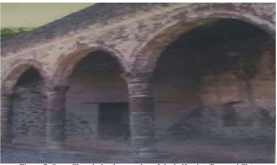
Figure 7. Open Chapel, the three arches of the half point

In the open chapel three arches are observed, the center refers to God the father, the right side to his son Jesus Christ and the left side to the Holy Spirit. It had the pedagogical goal of teaching the indigenous.