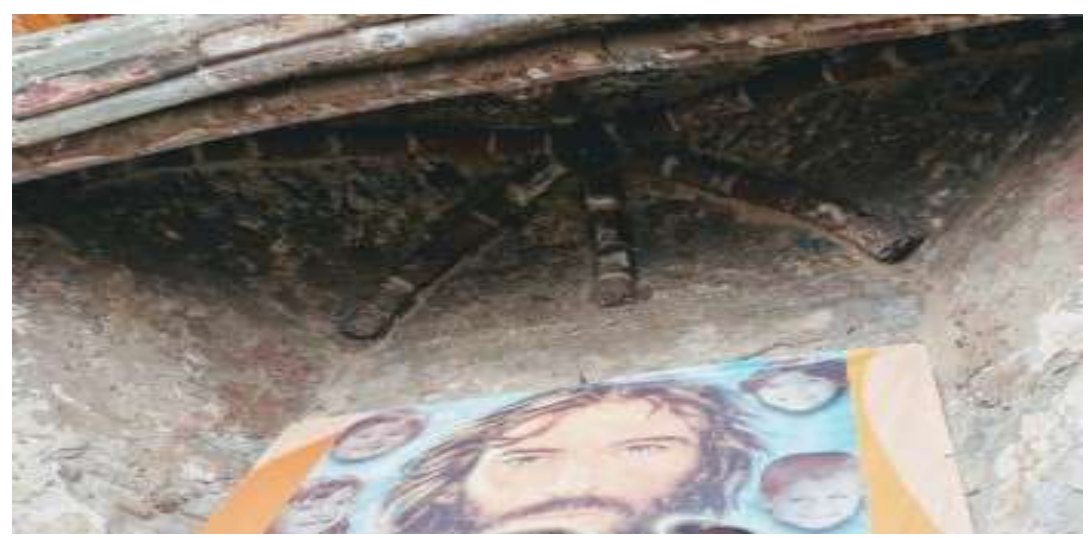
Figure 9. Rib with cempasúchil flower (Personal File)

According to the observation in the place the Ex-Convent of Atlihuetzía was built in several stages, which can be seen in its exposed walls where the first part is supported by ashlars of the pyramid, by stone, and later in some parts by walls of large dimensions, said walls with 1.40 meters. thick.