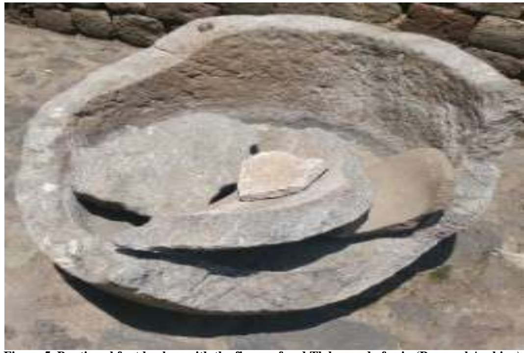
Figure 5. Baptismal font broken with the figure of god Tlaloc, god of rain

All that was going to be done was a religious syncretism<sup>4</sup>, as can be seen in the baptismal font that has an engraved Tlaloc.