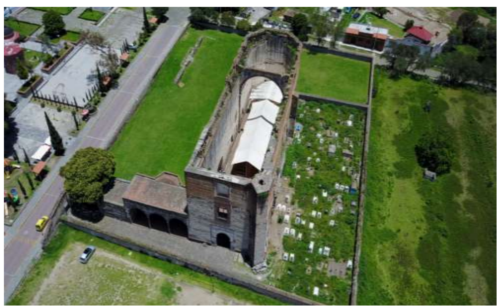
Figure 4. Aerial view convent Atlihuetzia