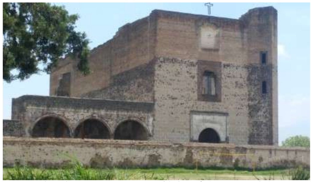
Figure 3. Temple and Ex-convent of Atlihuetzía

materials are stone, tepetate and brick, with a width of 1.40 mts. Account in its architectural program also with open chapel and choir, being its Federal property regime. The following historical data are known: Only the Temple and the chapel remain of this Franciscan convent complex (see figure 3). According to versions, it was drawn by Hernán Cortés on the 1st. January 1523. The destruction of the roof was in 1725. The convent tower was knocked down by a cyclone in July 1882. Its different materials on walls tell us that this temple was built in stages. By the remains of mechinales that exist in the sotocoro (see figure 4) it is noted that the choir was supported by beams. It still conserves open chapel and arches, to the left of this one the municipal pantheon is located, set delimited by low fence. Counts as movable mural painting. (Catalog INAH Tlaxcala)