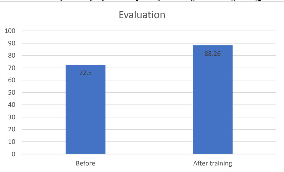
Table 4: Comparison of before and after implementing the training strategy..

Table 4 shows that the payment of property tax increased by 15.76% after applying the training strategy on the amount of property tax.