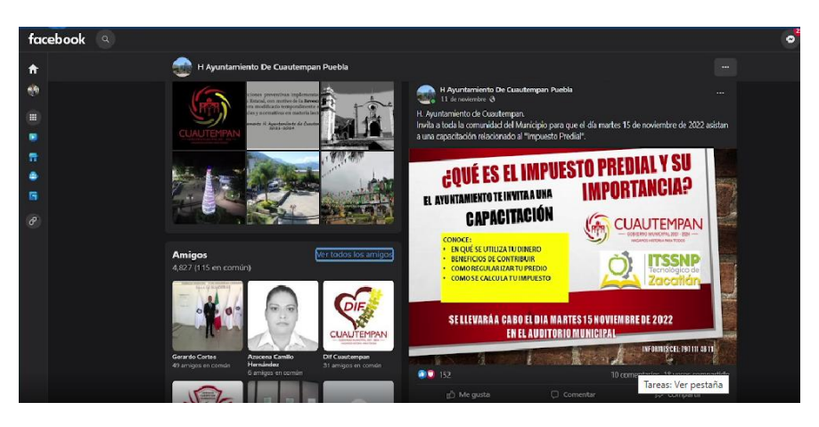
Figure 3: Invitation to citizens to take a Training on what is the property tax and its importance in social networksMunicipio de Cuautempan, Puebla.

The social networks team of the Municipality was asked to invite citizens to attend the training on what property tax is and its importance, where it is announced how the money is used, taxpayer benefits, how to regularize a property and how your tax is calculated, in the Municipal auditorium of the town as shown in figure 3.