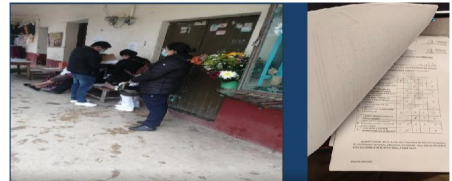
Figure 2: Initial survey applied to people in the Municipality of Cuautempan, Puebla.

The social networks team of the Municipality was asked to invite citizens to attend the training on what property tax is and its importance, where it is announced how the money is used, taxpayer benefits, how to regularize a property and how your tax is calculated, in the Municipal auditorium of the town as shown in figure 3.