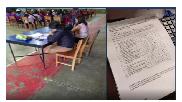
Figure 5: Completion of the second survey on Training the importance of property tax.

At the end of the training and with the help of the staff of the City Council, the application of the second survey was completed in order to observe if there was an improvement in the knowledge of the property tax in taxpayers as seen in figure 5.