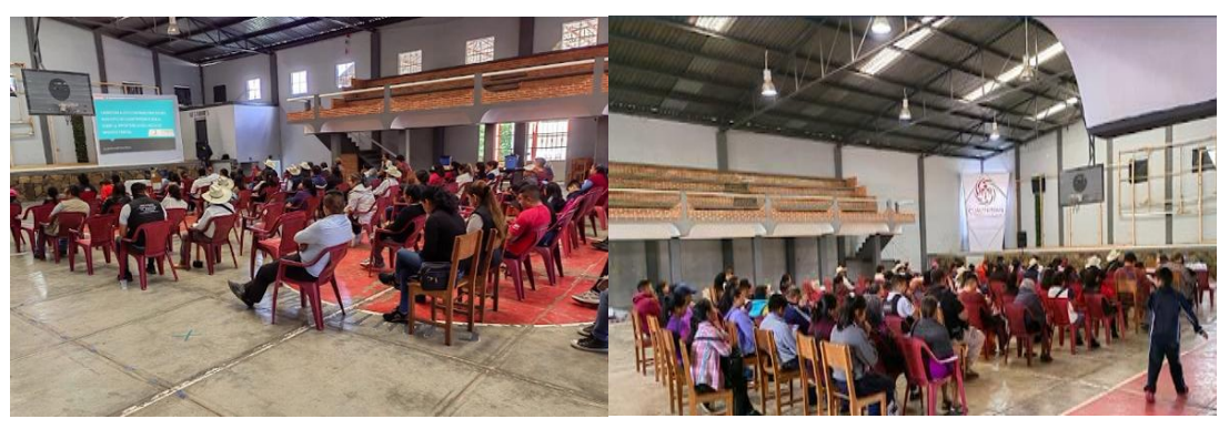
Figure 4: Training on what property tax is and its importation to residents of the region.

An official letter was written to the Municipal President to request permission to occupy the auditorium and thus be able to give the training; In the same way, an office was directed to us where we were granted permission, as well as the support of furniture, computer equipment to develop the training; The activity took place on November 15 of this year as shown in Figure 4.