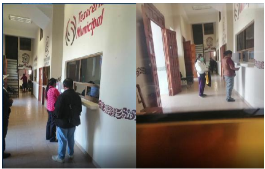
Figure 6: Citizens going to the window and regularizing their payment corresponding to the property tax

In the final phase, citizens were invited to go to the window to ask their current situation and if it was within their possibilities to regularize and pay the laggards, as shown in figure 6. We were granted recognition for training the taxpayers of the Municipality of Cuautempan Puebla, on the importance of paying property tax, signed by the President and the Treasurer of the Municipality. Of the 30 people trained, 15 paid their property tax.