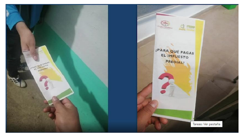
Figure 1: Brochures that were distributed at the entrance of the City Council of the Municipality of Cuautempan, Puebla

This research deals with tax management under the following three phases: Initiation, development of actions and procedures; and completion. The type of research is experimental, the instruments used to evaluate the proposal is the survey. Software tools such as: Microsoft Excel, Sagnet (Automated System of Administration and Government Accounting used by the Municipality) and Geogrebra were used. At the beginning of the study, a diagnosis of the current situation was made, the treasury files were consulted, the color labeled and the financial statements were ordered by year to make them easier to locate, the public accounts from 2018 to 2022 were analyzed, to observe the behavior of income and plan the procedure to follow. Triptychs were elaborated as seen in figure 1, with information to raise awareness among the population about the importance of being aware of the payment of the property tax which were left at the reception of the City Council so that people who were not able to take the training find out about the benefits they have by being up to date in their property tax payments.