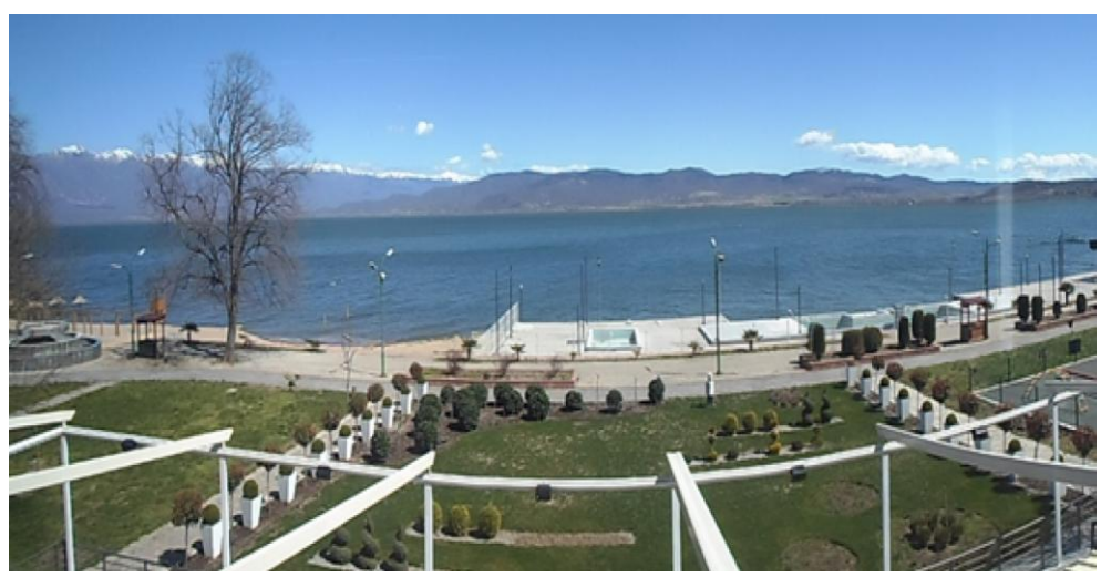
Figure 1:Panorama of Dojran Lake[22]

Tourists structure in the "Dojran tourism" is primarily dominated by domestic tourists and a negligible share of foreign tourists, especially Bulgarians and Greeks. Thus although tourism practiced more than half a century, Dojran and the Dojran lake are still has a national tourist destination.