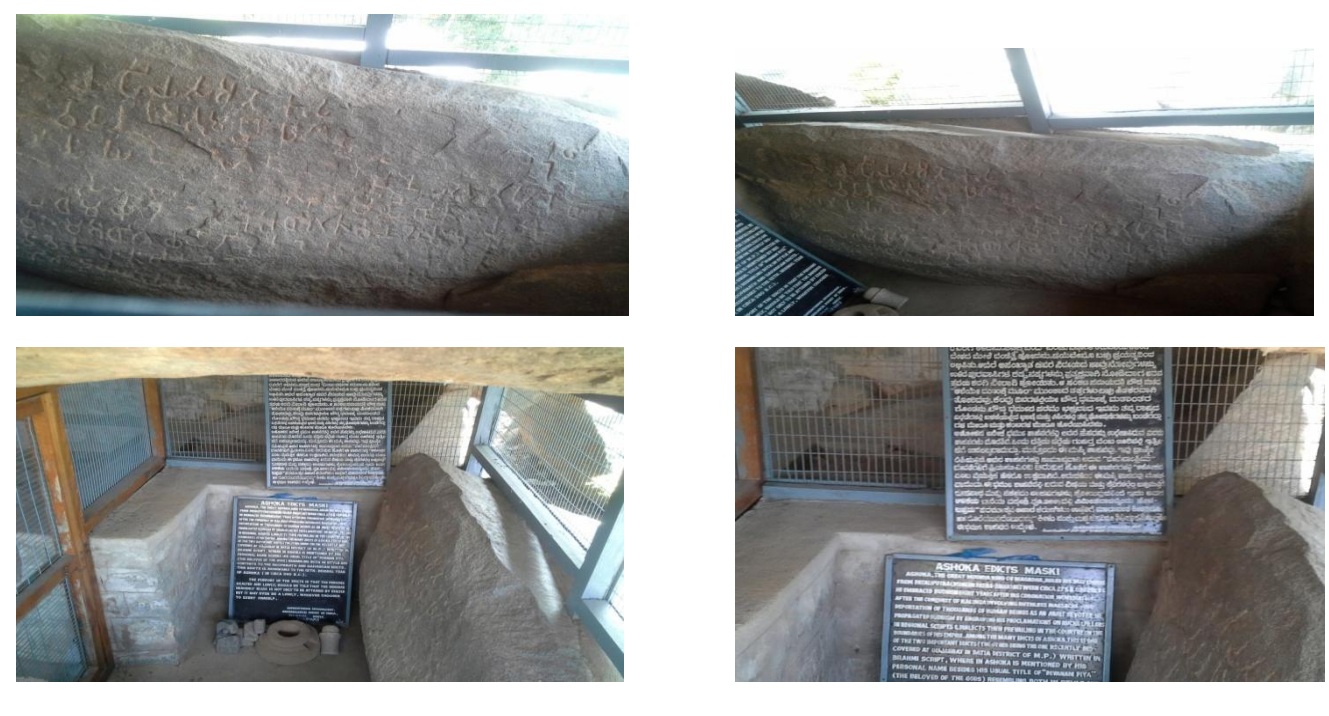
Fig.3.Maski Rock edicts

6.THE MESSAGE: A reconstruction of the edict reads thus: "For two and a half years I am a lay worshipper of Buddha. (For more than)...I have gone to...the Sangha...I have gone to...Before in Jambudvipa...now they have become mixed...This purpose is even able to be attained by a lowly person who is joined with dharma. It is not only to be seen that a high person might attain this. It is to be said to a lowly person and a high person...Doing thus...Thus (it will be) long standing and will increase (up to) one and half." The edict is highly fragmented.