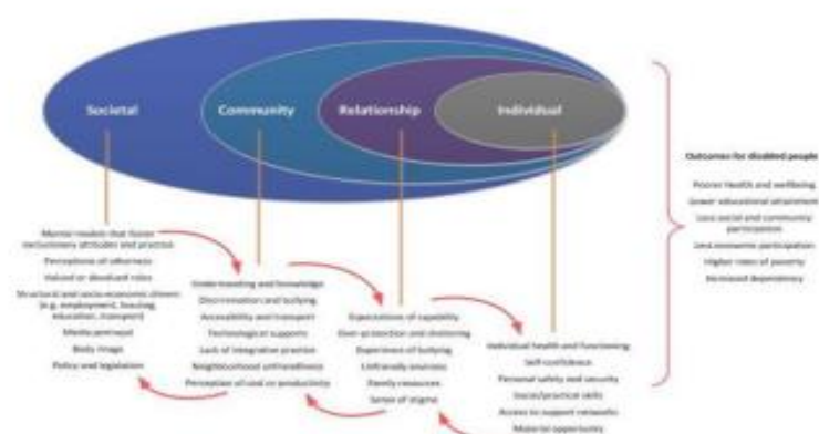
Figure 1: Education

These vary from special universities to full education. With the exception of the very last training gadget, special schools are in early cases, a voluntary submission was made by special schools in the Asian USA. There were about ten unique schools in the Asian United States of America by the usage of the Nineteen Fifties. Thirty years later, in the 1990s, there was a surge in terms of quality. About 1100 unique faculties were produced and the United States spread all spherical faculties. Due to the development of acts Same possibilities, protection of rights and full participation, 1995, policies and consequently the ease of quite a few varieties of professionals qualified to display in special schools, this increase was by and wide. It is laborious to estimate the acceptable range as directories have not been included among those who produced such colleges a few years ago. In addition, the maximum number of them are tested in or agreed with as communities. Therefore, due to poor documentation, there's no acknowledgment of those special colleges. In addition, large parent companies in Asian united states have developed special faculties for young people with intellectual disabilities in many elements of the country over the years, representing the participation of parents.