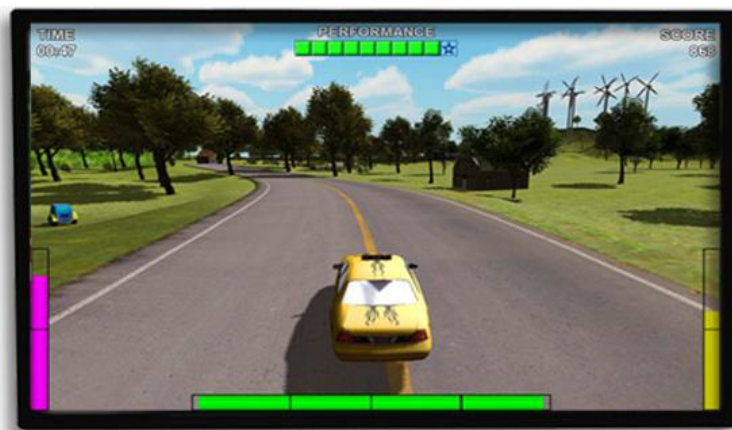
Fig. 1. The shrinking screen was presented during neurofeedback (alfa/theta coherence) session as a confounding factor . http://zukor.com/interactive/

Zukor's Drive also includes all the standard features of Zukor feedback games, such as profiles, scores, auditory feedback, period/session length presets and more. It is Zukor Interactive's most ambitious feedback game and is certain to focus your clinical patients and engage those undergoing peak performance training.