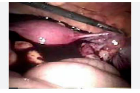
Figure No. 3 Diagnosed hemoperitoneum.