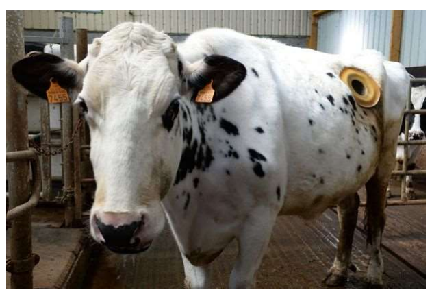
Figure 2 Cow with a hole for research purposes .

The NZAVS (2020) is a society with fundamental principles that people are misled by vivisection and in the name of science and medical field it is represents a fraud and a danger. In other words unethical. NZAVS (2020) argued that, for profits and for industrial use, holes like window shaped are drilled inside cows and they have to live with that their whole lives. It is known as the Fistulation surgery of the rumen. Newby et al. (2014) described in details the procedure of this type of experiment on animals. The Animal Care Committee, University of Guelph provided approval for the study. According to the Mirror (2019), the animal rights group L214 qualified this practice as inhumane and to ban these experiments.