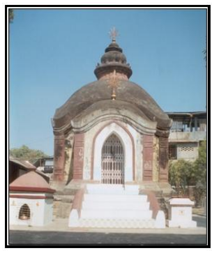
a. Front View