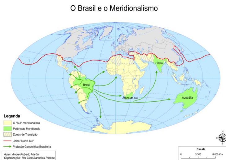
Illustration 2 – Meridionalismo