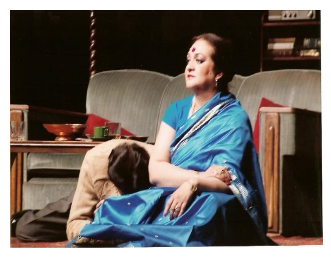
Figure 2: The scene between Deepak and Chitra and his final surrender from Yatrik's '9 Jakhoo Hill'

The other scene between ambitious young Deepak and his conniving shrewd mother Chitra, played from an indiscriminate bored limpidness to a shattering climax "Fig.2".